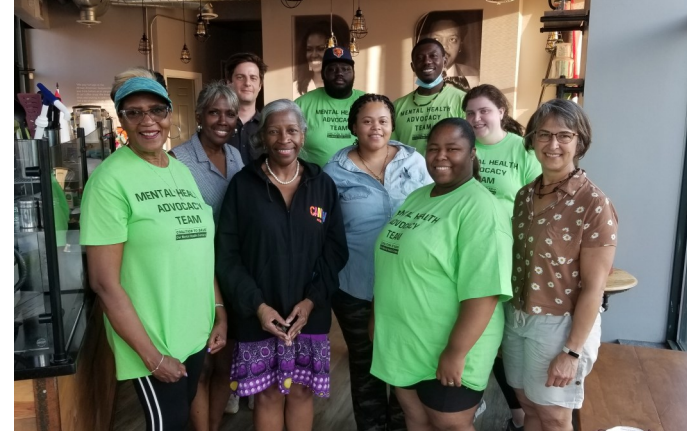
Southeast residents and advocacy team members gathered 8,982 signatures from registered voters to place the necessary referendum questions on the ballot.

Join us with your support in creating a new mental health center for our community by voting “YES” on both referenda questions on November 8th .