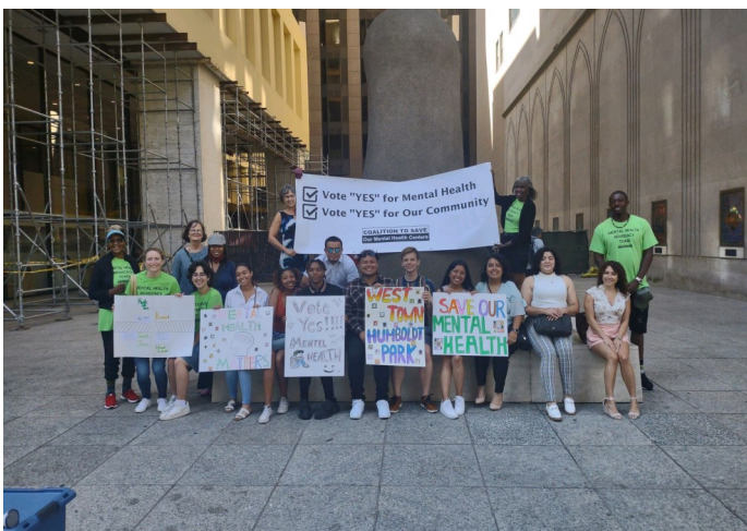
Southeast Community Action Team (C.A.T) and the WTHP advocacy team holds press conference for the submission of signatures at the Chicago Board of Elections.

On Friday, August 5, residents submitted 8,982 signatures of registered voters in the Southeast area to place the two necessary referenda questions on the ballot. The first question creates the EMHSP while the second provides additional protection for the taxpayers against excessive annual increases in the total levy they have approved for the first year.